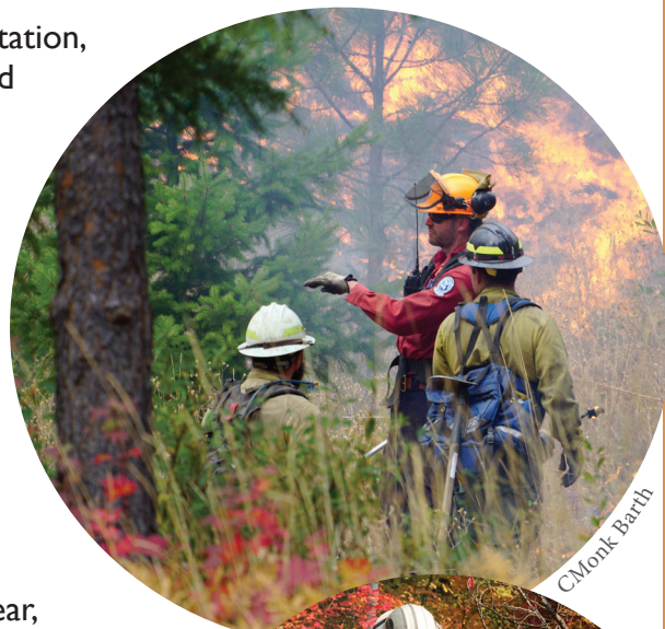
C/ Monk Barth

6 Identifying and supporting opportunities to reduce implementation barriers related to air quality and weather. This may include investing in community and land manager prescribed fire outreach programs, supporting direct work between land managers and air quality regulators at the local and state levels, and addressing other non-weather related constraints to burn windows.